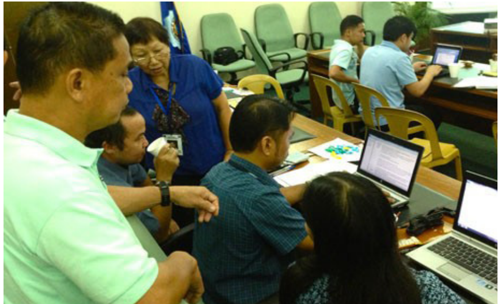
Enhancing communication competencies. NRCP participants polish their news stories during the communication skills training held in NRCP, Bicutan, Taguig City.

The training signals the start of the collaboration between NRCP and CDC in further enhancing the